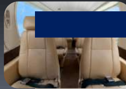
PIPER CHIEFTAIN PA31