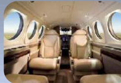
KING AIR B200